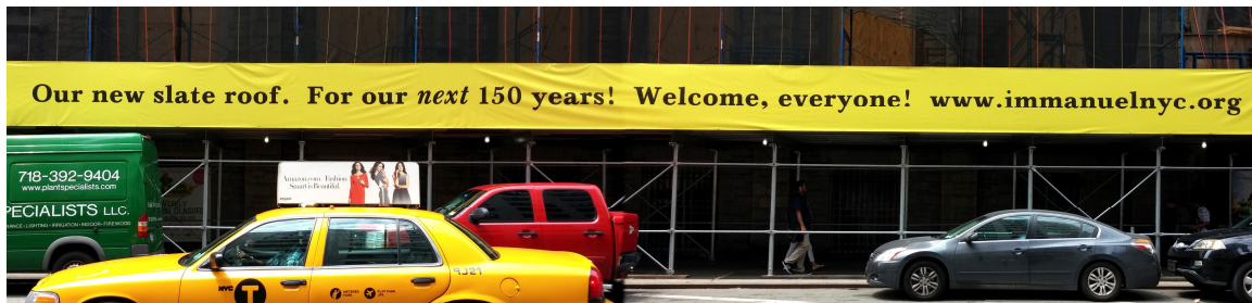
Our scaffold banner along Lexington Avenue