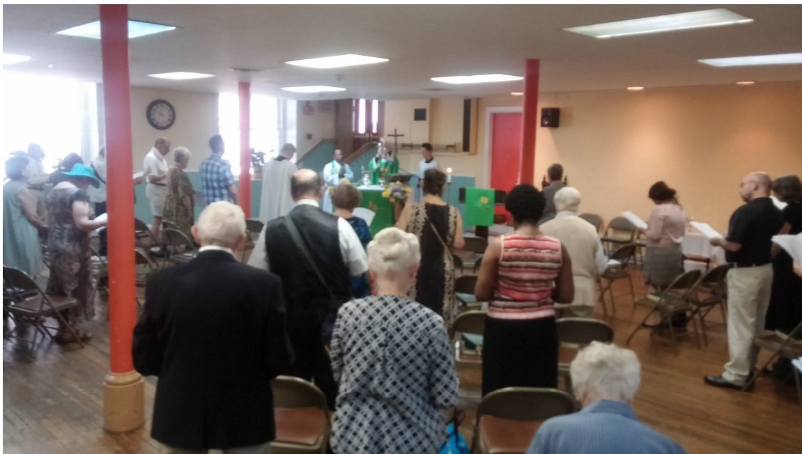
Worshiping in the Undercroft